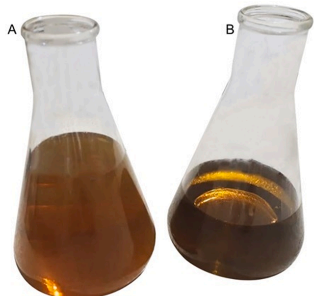
Fig. 1. Oils extracted from Scapsipedus icipe (A) and Gryllus bimaculatus (B).