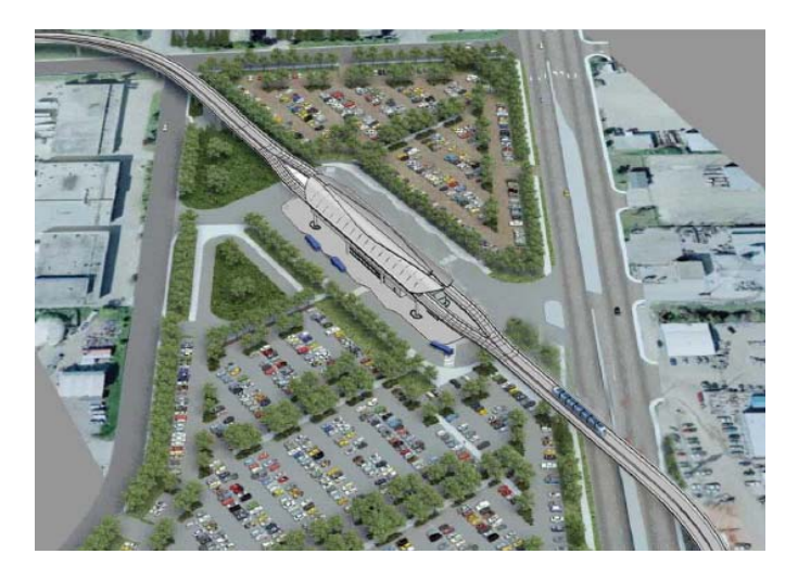
Fig. 2. Exploration of a new project in the context of existing conditions using BIM (Source: [9]).

based survey/ geographical information systems (GIS) techniques generate detail-rich point clouds of data that can be imported directly into the BIM software.