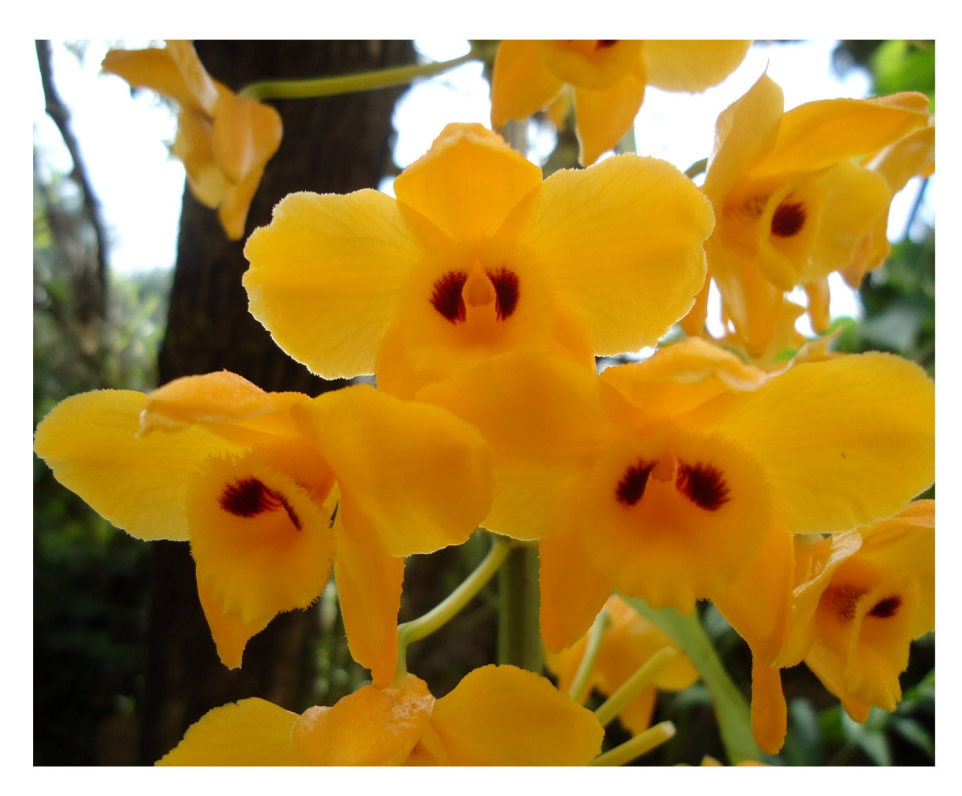
Figure 1. Flowers of Dendrobium chrysanthum .

which they are highly valued in traditional Chinese medicines (Pharmacopoeia Commission of PR China, 2005). This species has also been reported to be used by the Khasi traditional healers of Meghalaya, India, to treat external injuries and fractured bones (Hynniewta and Kumar, 2008). Many orchids including D. chrysanthum have become threatened in nature due to rapid habitat destruction and increased biotic influences. Therefore, to prevent them from becoming extinct, their propagation and conservation need immediate attention (Tandon, 2000: Tandon and Kumaria, 2005).