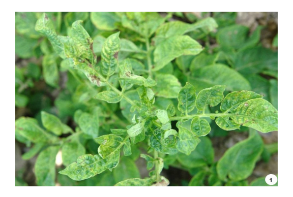
Figure 1. Mosaic, chlorosis, decreased leaf size and leaf malformations on a potato plant.