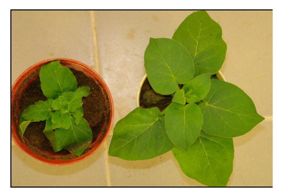
Figure 4. Stunting and leaf deformation in N. glutinosa (Left: Inoculated with PVY, Right: Healthy plant).

These viruses have previously been detected in other regions of the country; however, this is the first time that they were determined in this region of Turkey. Çıtır et al. (1999) found that PVX was prevalent in Tokat province. In the survey conducted in Van province for potato viruses, PVX and PVY were found as single infections, whereas PLRV and PVA were detected as mixed infections with PVX+PVY (Demir et al., 2001). During 2003-2004, Güner and Yorgancı (2006) performed research to detect viral pathogens in potato growing areas of Niğde and Nevşehir provinces, by using serological and biological methods. They found PVY, PVS, PVX, PVA and PLRV viruses as single or mixed infections in both potato leaves and tubers by using DAS-ELISA method in Niğde and Nevşehir provinces. Bostan and Haliloğlu (2004) found PLRV