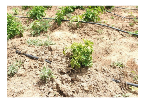
Figure 3. Stunting of potato plants.

chlorosis and stunting (Figures 1, 2, and 3). These symptoms on potato plants were similar to previous reports for potato viruses (Brunt, 2001; Stevenson et al. , 2001). All leaves and tubers were tested by DAS-ELISA for PLRV, PVY, PVA, PVX and PVS. The result of serological tests showed that potato plants were infected with these viruses. The tested samples (244 samples) were infected