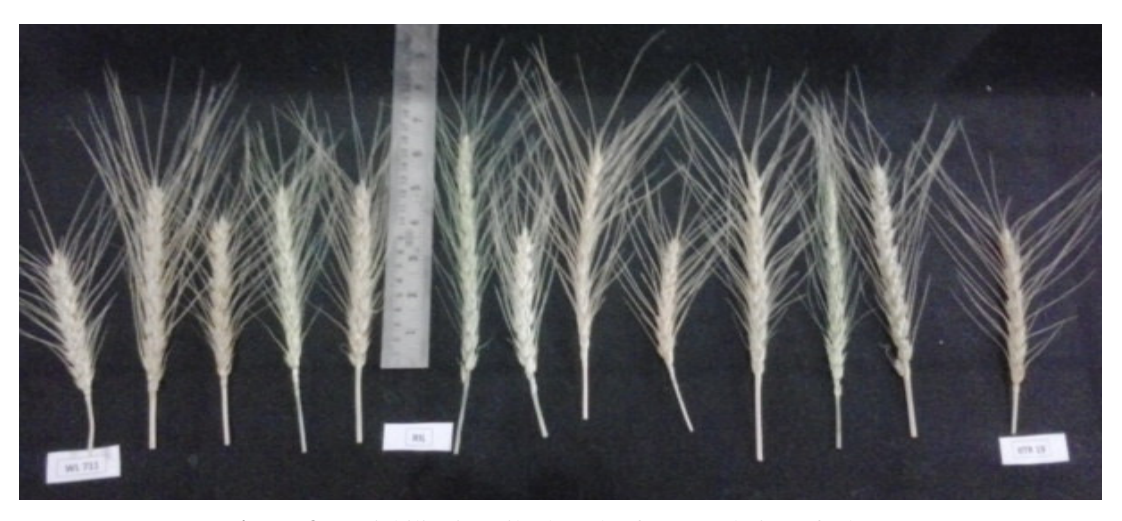
Figure 3 . Variability in spike length of F_2 population of wheat.