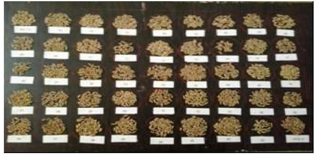
Figure 2 . Grain color of F_2 population of wheat.