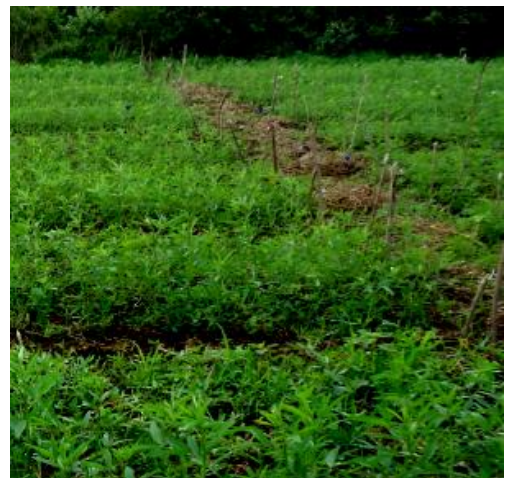
Plate 6: Growing slender leaf in Field 2