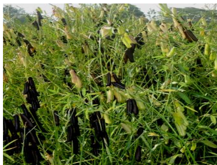
Plate 3: Crotalaria ochloreuca growing in field. Plate 4: Crotalaria brevidens