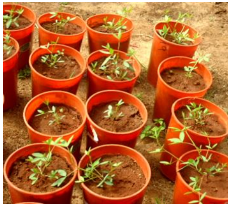
Plate 1: Crotalaria brevidens

that contained the growing media. After pricking the seedlings, watering was done to field capacity three times per week. The plants were maintained weed free by hand pulling of any emerging weeds. Data collection commenced three weeks after germinating and continued weekly until the 15 th week when the seeds matured and were harvested. Data collected included, plant height, the number of leaves, the number of branches, the number of pods, seed yield and seed weight (g/1000). The first greenhouse experiment was conducted in the month of January 2013 to May 2013 and the second experiment was carried out in the month of June to November 2013.