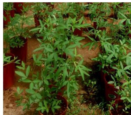
Plate 2: Crotalaria ochloreuca