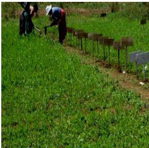
Plate 5: Weeding slender leaf in Field 1

Field layout was carried out in a field which had been ploughed and harrowed at JKUAT University Tuition farm at the African indigenous vegetable section. Split plot experimental design was used where species was the main plot factor while eight phosphorus levels were the subplots. Plots of 1m x 7m were measured out for the two Crotalaria species, and this were replicated four times resulting in a factorial experiment with two slender leaf species and eight fertilizer levels. Four rows 30 cm apart were made in each plot. Different fertilizer rates of 0, 15, 30, 45, 60, 75, 90 and 105 kg P 2 O 5 ha -1 were applied per plot respectively. Seeds were drilled in the rows and covered thinly. Watering was done to field capacity, thrice per week using overhead irrigation method. Thinning was done to maintain a spacing of 30 cm between plants. Weeding was carried out to maintain weed free fields. Data collection commenced three weeks after germination just like in the Greenhouse study earlier explained in section 3.1.1. The first field study was carried out in July 2013 to October 2013, and this was repeated from November 2013 to March 2014.