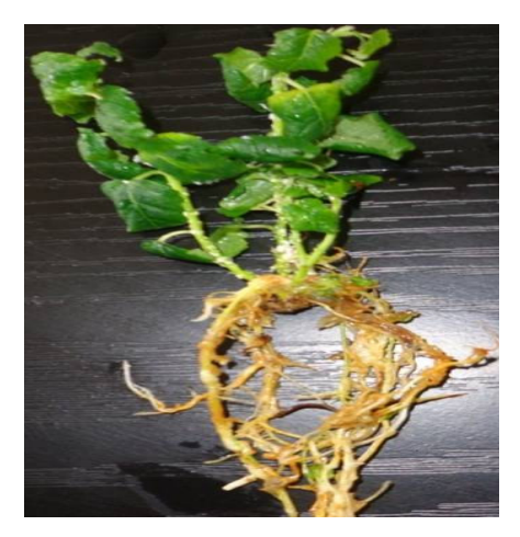
Figure 4. Multiple and long roots of fig vitroplant induced on medium M_{11} .

Single vigorous plantlets of each variety were transferred to different rooting media M_9 , M_{10} , M_{11} and M_{12} to induce and develop the root system (Figure 4). Results showed that plant rooting rate was significantly impacted by the variety and rooting media effects (Table 4). The highest percentages of rooted plants (83.34%) occurred for SNI on M_{10} and ASF on M_{11} . In addition, M_{11} contained half strength of MS and 1 mg L<sup>-1</sup> IBA gave best results for ZDI plants (75%). These results were in conformity with previous reports (Kumar et al., 1998; Yancheva et al., 2005; Soliman et al., 2010) where in vitro rooting of fig vitroplants was facilitated by 1 to 2 mg L<sup>-1</sup> IBA containing media. M<sub>11</sub> induced development of longest roots in ASF (52.4 mm) and variety SNI (39.2 mm) (Table 5). Furthermore, highest number of secondary roots of ZDI (11.5), ASF (9.7) and SNI (10.7) plantlets were recorded on M<sub>11</sub> medium. Therefore, the composition of this medium (with reduced nitrogen and auxins) was, globally, the most suitable for fig vitroplant rooting. Similar findings for other plant species were mentioned by many authors (Ebrahim et al.,