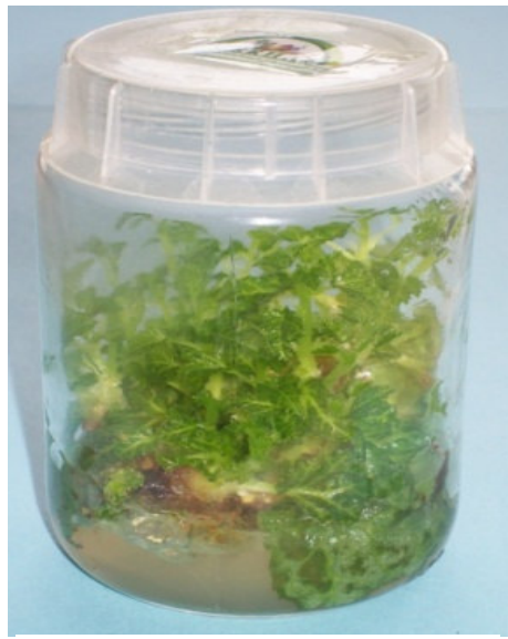
Figure 3. Proliferation and elongation of fig shoots on medium M_6 .

greenish and with small amount of basal calli (Figure 3). BAP is a very critical cytokinin for proliferation. It was reported to stimulate multiple shoot formation in vitroplants (Saidi et al., 2007; Singh et al., 2010; Karimpour et al., 2013; Zuraida et al., 2014). Also, the proliferation medium M<sub>6</sub> contained GA<sub>3</sub>, which is considered to be essential not only to improve the growth of the explants, but to increase significantly the number of nodes and leaves (Rostami and Shahsava, 2012). For SNI, the best proliferation rate (9.0 branches per plant) was provided by the medium M_5 . The lowest rates were, generally, obtained by the medium M<sub>8</sub> containing Kinetin as reported by Mustafa and Taha (2012). On medium M<sub>8</sub>, the shoots were stunted, with callus and some yellowish leaves. This may be due to reaction effects of Kinetin and NAA on plant respiratory metabolism (Akemine et al., 1975). The best plantlets elongation rate and increase in number of leaves were mainly provided by media M<sub>5</sub> and M<sub>6</sub> and the lowest values were recorded on M7 and M<sub>8</sub>. It appeared that BAP (M<sub>5</sub> and M<sub>6</sub>) had significant higher effects on the vitroplants. Similar results have been reported by Kumar et al. (1998) and Nobre and Romano (1998)