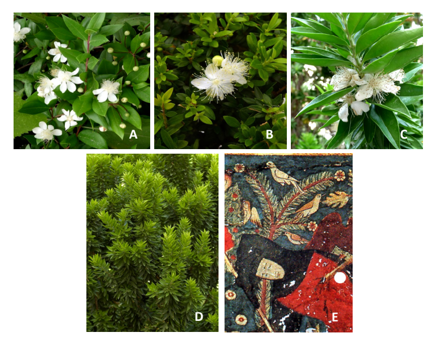
Figure 1. (A) Wild type Myrtus communis ; (B) Cultivated variety Myrtus communis subsp. tarentina ; (C) Cultivated variety Myrtus communis subsp. baetica (described by Pliny as hexasticham and named Moorish myrtle by Clusius); (D) Myrtus communis subsp. Baetica ; (E) Detail of painting of Hall of the Kings of the Alhambra, where the morphological characteristic of Moorish myrtle can be clearly identified.

This myrtle was widely used in the Alhambra until at least the 17<sup>th</sup> century (Mariutti, 1934) when it began to be gradually replaced by Myrtus communis subsp. tarentina for aesthetic and practical reasons (finer foliage, more compact growth), and the Moorish myrtle was