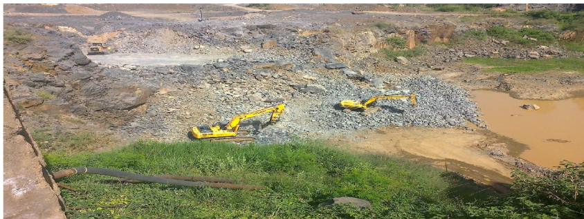
Figure 2: Depleted quarry in Kisumu County