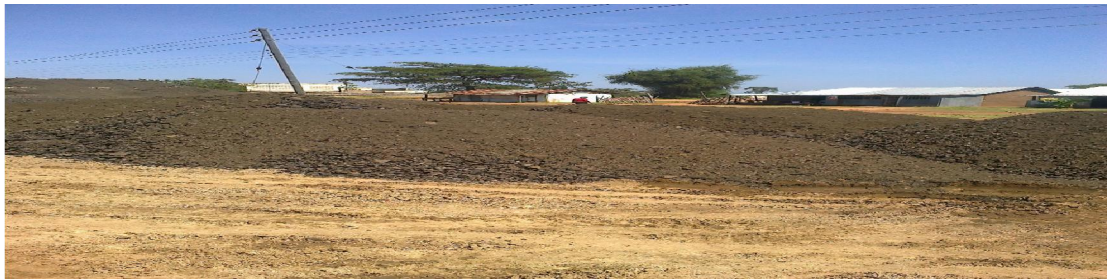
Figure 4: Reclaimed Asphalt Concrete stock piled along Kisumu-Kericho road project