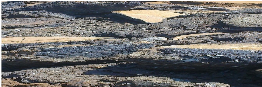
Figure 1: Reclaimed asphalt concrete dumped in open spaces

The suitability of reclaimed asphalt concrete cold mix material for surfacing of low volume roads means provision of whole-life benefits as this; lowers transport (construction, maintenance and vehicle operational) costs; increase social benefits (more reliable access to schools, clinics, etc) and reduce adverse environmental impacts and health and safety problems while reducing the rate of depletion of natural aggregate resources (Figure 1 and 2).