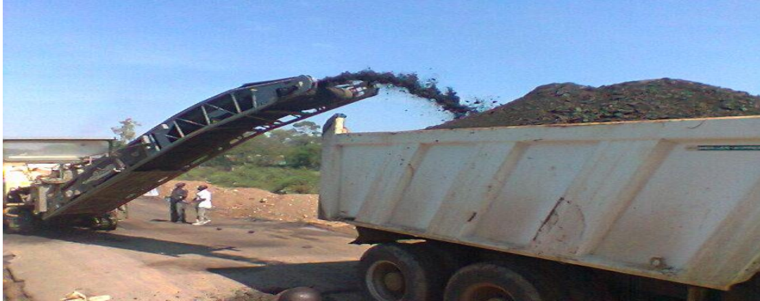
Figure 3: Milling activities on Kisumu – Kericho road project