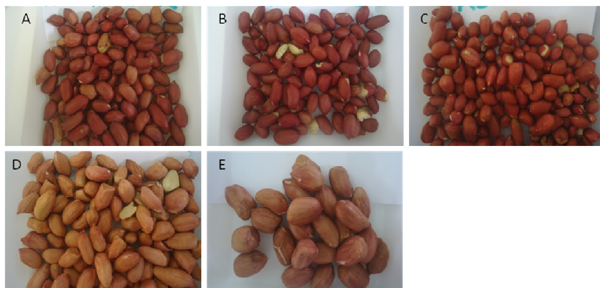
Figure 1: Major groundnut types traded in Nairobi and Nyanza markets in Kenya. (A) Red regular, (B) Red mixed, (C) Red small, (D) Pink regular, (E) Pink large.