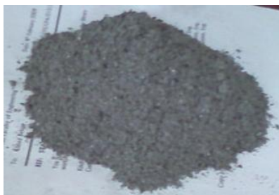
Figure 1: Municipal solid waste ash

The bottom ash was made up of different types of amorphous particles. In addition to the fine particles of combustible organic matter, unburned municipal solid waste and palletized plastic slag were also present (Figure 1). The colour of the ash ranged from grey to black, depending on the amount of unburned carbon in the ash. The dry lumps possess cohesion, but could be powdered easily in the finger.