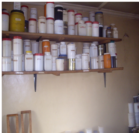
Plate 3: Stored ground herbs at herbal clinic