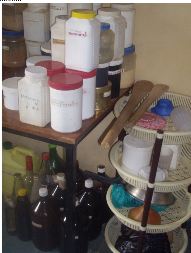
Plate 10: Formulation room with equipment.

One herbalist processed and formulated his drugs at a separate location from his clinic (plate 10). All others prepared the drugs at the same location where they received patients. Three TMPs dispensed their drugs as powders and one as a suspension.