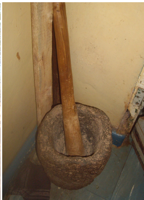
Plates 5 and 6: Traditional tools (pestle and mortar) used to process herbal medicine