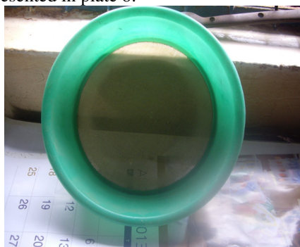
Plate 8: Sieve used to strain good materials

Sieving was done after size reduction using modern sieves. This was done to further remove unwanted large particles. A picture of the sieve is presented in plate 8.