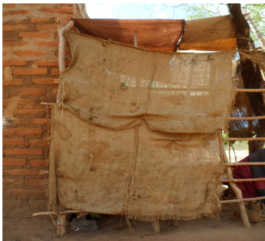
Plate 4: A herb drying shelter